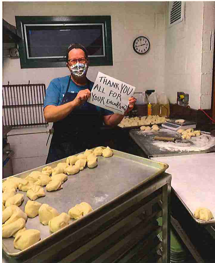
Bread Ministry – serving body and soul

I will begin with a prayer of thanks for our community's continued support and prayers during what has proven to be a year like no other! Even in the midst of COVID, God is present.