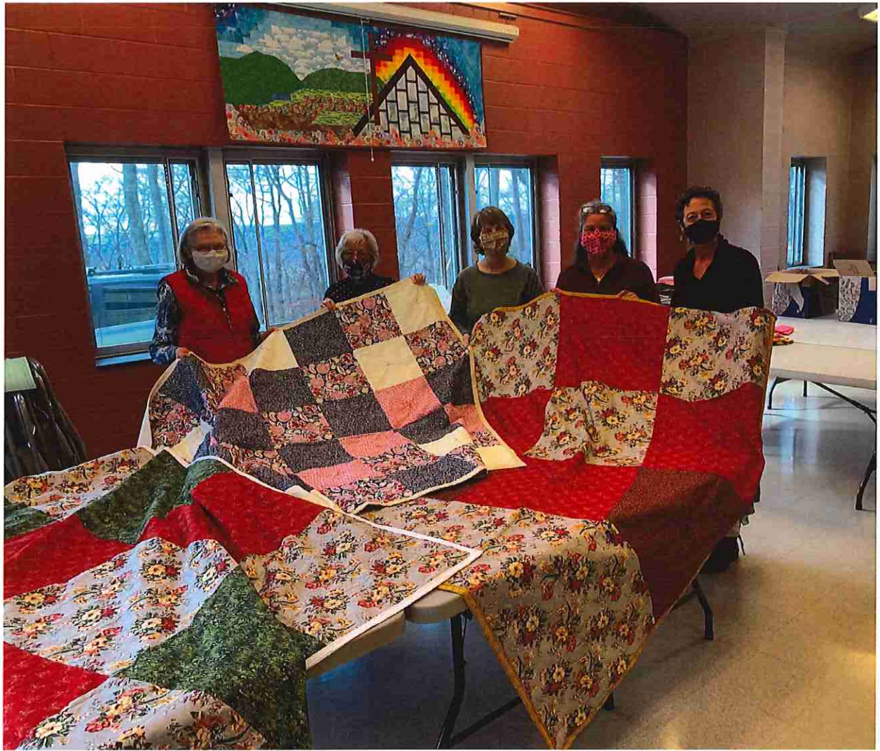
MountainService Quilts and Kits for Lutheran World Relief

"I thank God each time I remember you." Philippians 1:3