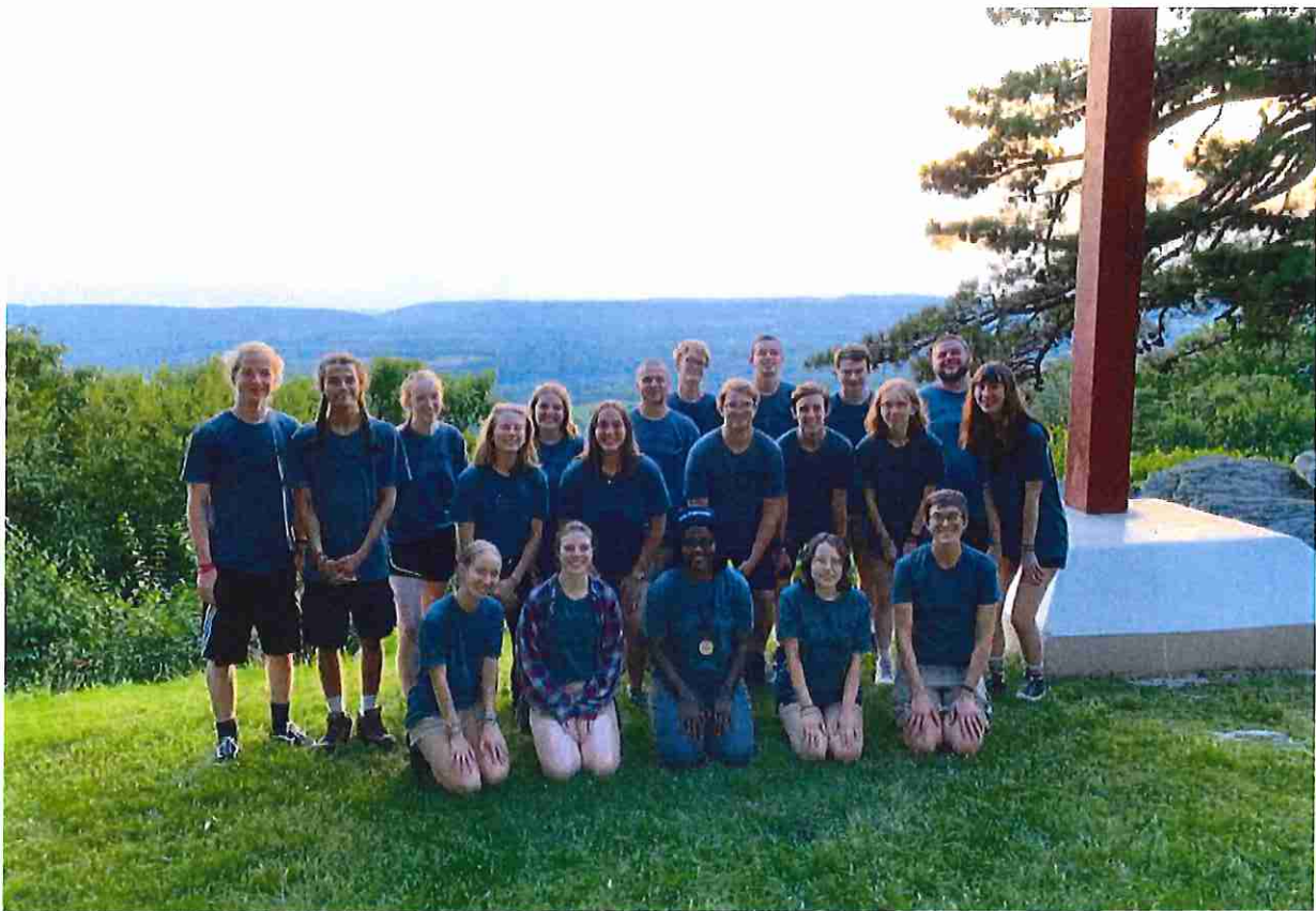
2022 Summer Staff

1 Unforgettable summer of camper memories to last a lifetime!